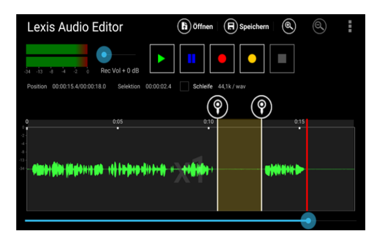
Mobile Reporting / Page 11

Whether you want to cut something out, copy a section to somewhere else or use a specific effect: the first step is to mark the section in question. You can do this using the two markers (as shown in the picture). They mark the beginning and end of your selected area.